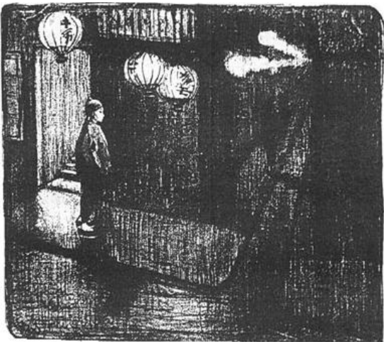
“The hour when he was wont to go by”

“He will pass again,” replied Lum Choy. “Ku Yum is not here now, so he does not make this his way. But he must pass some time. Tell me the hour when he was wont to go by and I will watch day after day and never weary until I have run him down.”